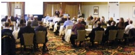
Participants at the Seminar